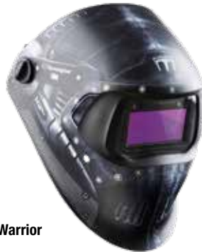
Trojan Warrior 751620