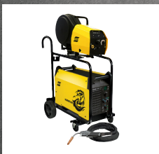
Part No.: 0465 250 881

The new user friendly and robust feeder.