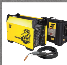
Part No.: 0558 102 222

Portable, durable wire feeder with the most advanced features to meet today's welding requirements.