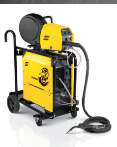
Part No.: 0465 427 880 NOTE: Part No relates to cool unit ONLY