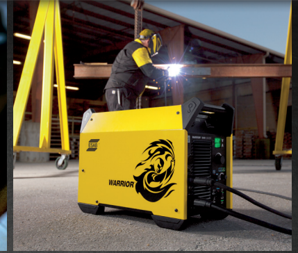
WARRIOR™ 500i CC/CV