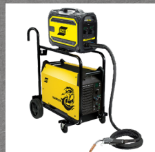
Part No.: 0445 800 883

The most durable and reliable combination for heavyduty MIG/MAG welding with Stick (MMA), TIG (GTAW), and gouging capabilities.