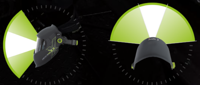
Comparing fields of view: standard ADF vs. optrel panoramaxx