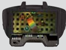
40 00 85