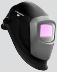
40 13 85