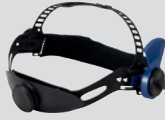
70 50 15