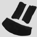
16 40 05