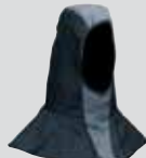
16 91 00